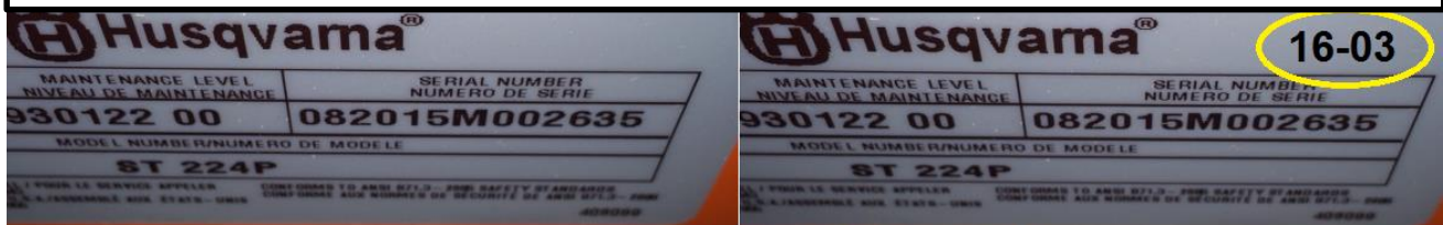
Serial Plate Before

6. Using a permanent marker, write "16-03" in the upper right corner of the serial plate to indicate service is complete.